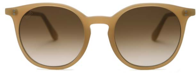
TEDDYS Sycamore - Matte Honey teddyseyewear.com

These vintage-inspired sunglasses by SB based designer TEDDYS are perfect for endless days at the beach.