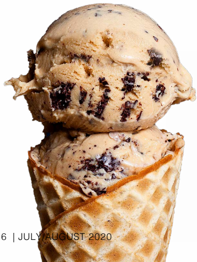
Gelato Boy Coffee Chip Gelato gelatoboy.com

These vintage-inspired sunglasses by SB based designer TEDDYS are perfect for endless days at the beach.