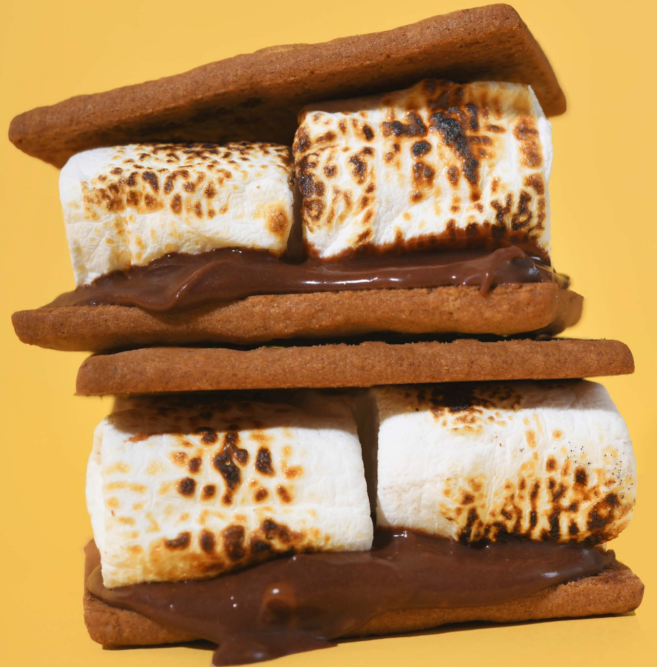
Dandies Vegan Vanilla Marshmallows Available for purchase at Whole Foods and dandies.com