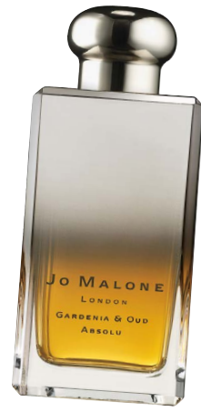
Jo Malone London Absolu Gardenia & Oud Cologne jomalone.com

The new, go-to-wear-anywhere blazer that we're obsessed with! Day to night, work to cocktails, jeans, skirts, leather leggings—you name it. These locally designed YAJIAN blazers will be your new uniform.