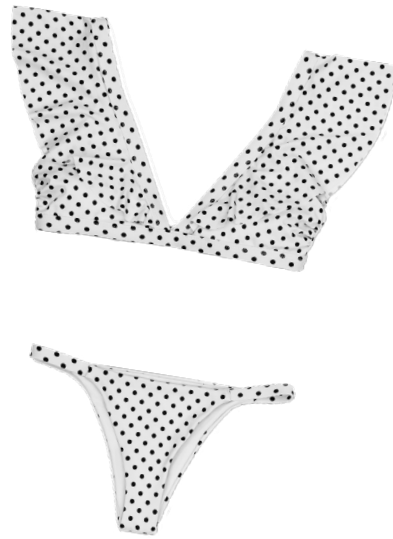
Tori Prayer Bikini Available for purchase at Bonita Beach Carpinteria toripraverswimwear.com