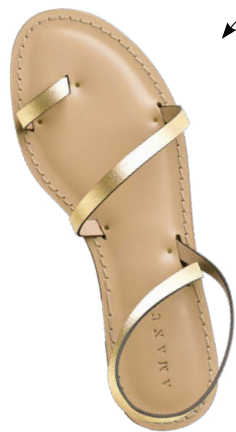
Amanu Sandals amanustudio.com

A way to make these custom sandals even better? Have them made on your next trip to Cabo at Auberge resorts Esperanza or Chileno Bay, where Amanu has set up shop.